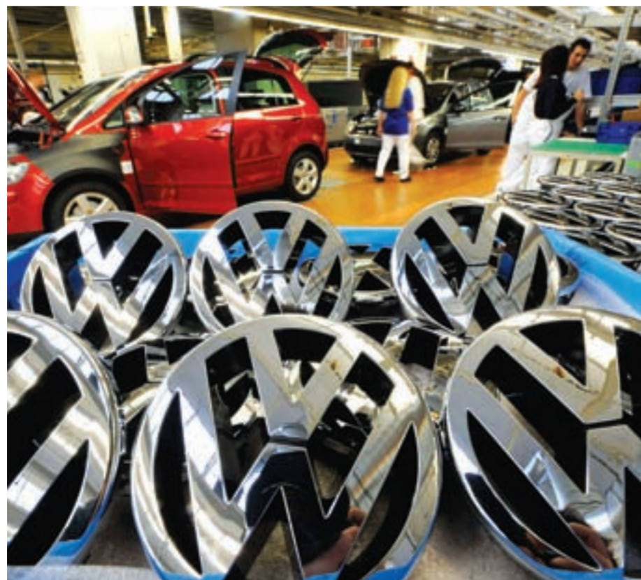
FILE - In this Nov. 14, 2008 photo the VW logos of German car maker Volkswagen are ready to be assembled in a production line of the 'Golf VI' at the Volkswagen headquarter in Wolfsburg, Germany.

Piech has expressed admiration in the past for cars built by Suzuki, and late last month said VW was considering a cooperation agreement with the Japanese company in the field of city vehicles. -AFP