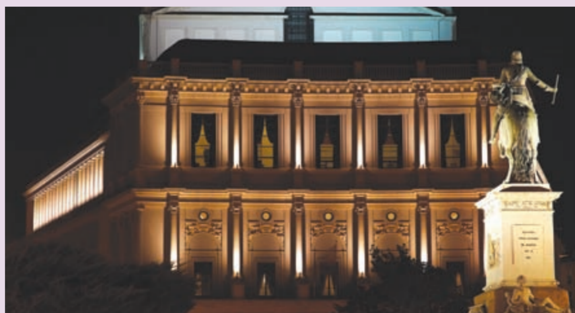
Madrid Opera's new Belgian artistic director is promising to finally deliver the goods by turning the 160-year-old Teatro Real into a 'Laboratory of 21st Century Opera.'

Some of the world's most famous artists have performed there, but its history has also been plagued by problems ranging from fires and decay to financial strains, power struggles and temporary closures. After the 1991-97 renovation, the Teatro Real was hailed as one of Europe's most advanced opera buildings, combining sumptuous neo-classical architecture with the latest stage technology. Yet despite the renovation costing more than 100 million euros (134 million dollars), the opera located opposite Madrid's royal palace still has a relatively modest international ranking, far from the league of Milan's La Scala or the Royal Opera House in London's Covent