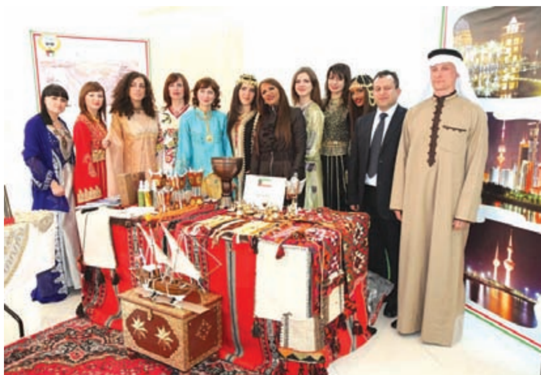
Kuwait's booth displayed at the Arab Culture Day activity in Ukraine.

KIEV: Kuwait's Embassy in the Ukraine participated in the Arab Culture Day which included several cultural and social activities, with a special section highlighting the Kuwaiti heritage.