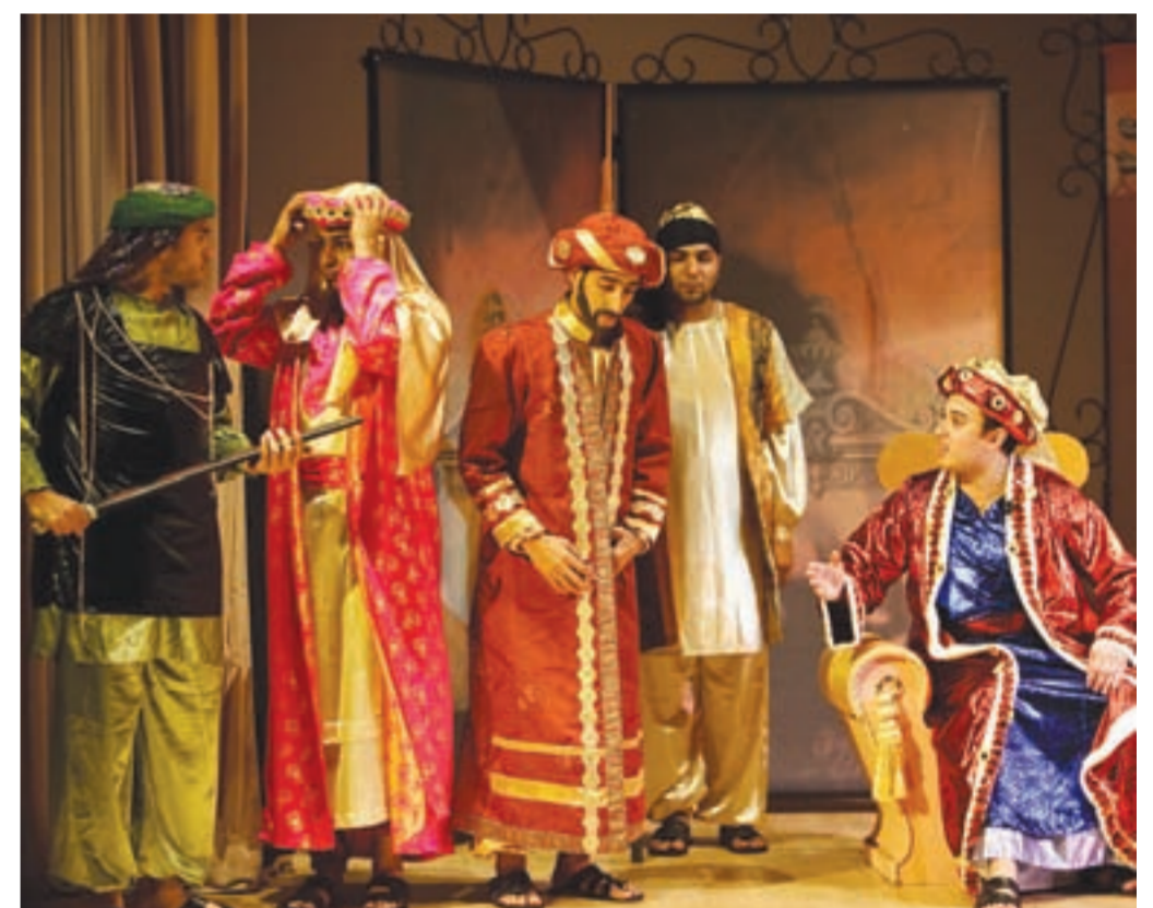
Hakawati performance in Abu Dhabi

He is performing as part of the Abu Dhabi Festival 2010's community program, which extends the benefit of this world-class festival