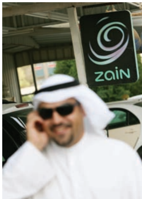
FILE - A picture taken on Sept. 23, 2008 shows a Kuwaiti man walking past the logo of Zain company as he speaks on his mobile phone in Kuwait City.